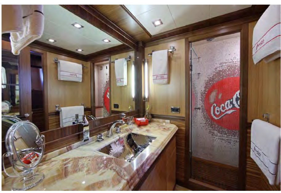
All rights reserved to ISA