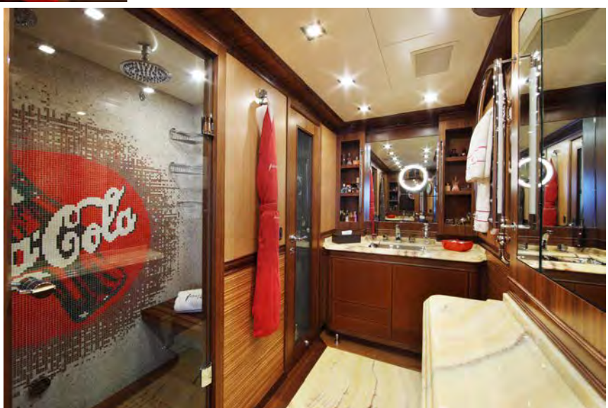
All rights reserved to ISA