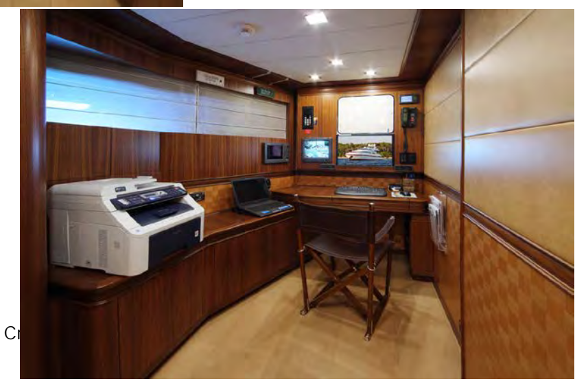
All rights reserved to ISA